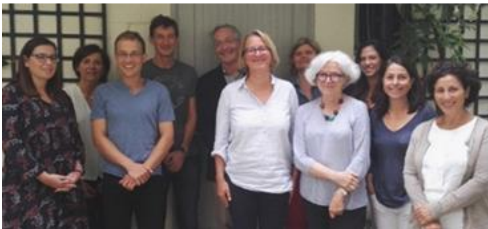
Team of the French network of vascular diseases of the liver

Coordinator of the reference center for vascular diseases of the liver - Beaujon.