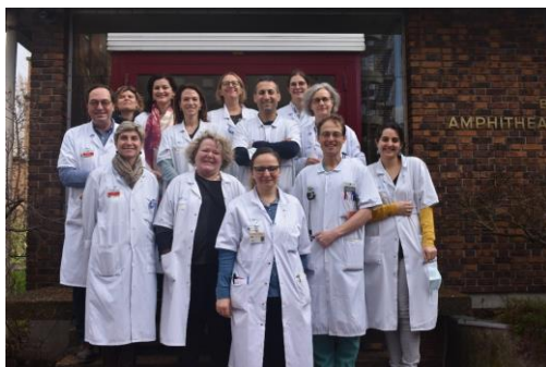
Beaujon Hospital-RIPORT study team

One hundred and eleven patients participated in the study. The majority were men (56%) with a median age of 50 years. At the start of the study, more than 70% of the patients were receiving anticoagulant treatment with antivitamin K (e.g. warfarine or fluindione). More than half of the patients had thrombosis in and outside the liver and one third had oesophageal varices. After random selection, 56 patients were treated with xarelto 15, and 55 were not receiving anticoagulant therapy (see figure 1).